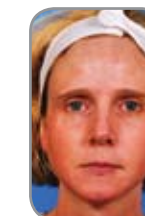
14 Days Post-Op