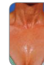
14 Days Post-Op