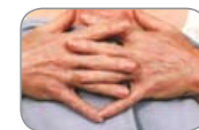
14 Days Post-Op